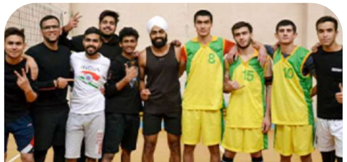
Indian students with their partners at a basketball tournament