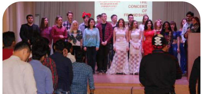
PSMU Students at a campus celebration