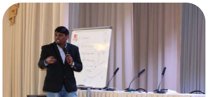
Indian guest lectures providing training to Indian students