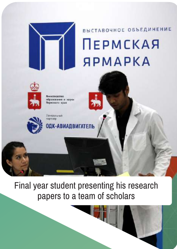
Final year student presenting his research papers to a team of scholars