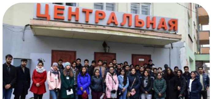
Students enjoring the city monuments