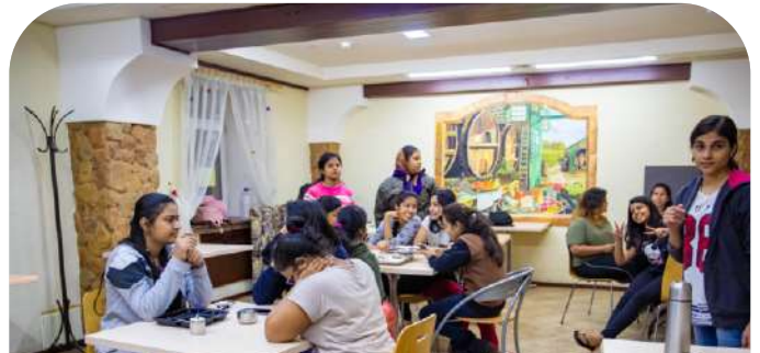
The hostel vicinity have their own meeting rooms