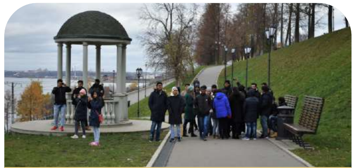
PSMU students enjoying scenic views of Perm city