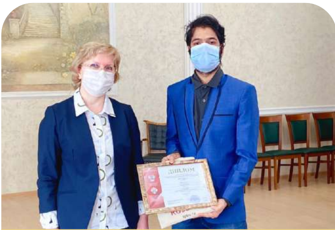
Rector, PSMU with an Indian student