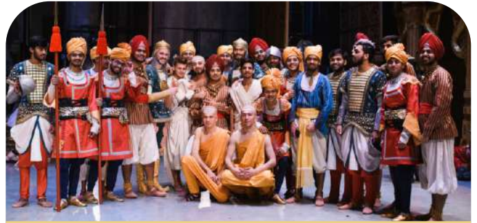
Indian students at a role-play event at PSMU