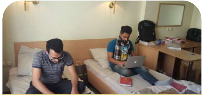
A look into boys hostel of PSMU