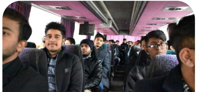
Students on the a bus to dicover the city