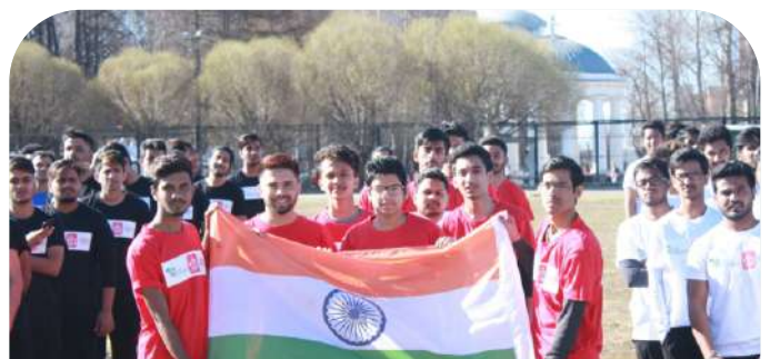
Indian students with the Indian flag at an event