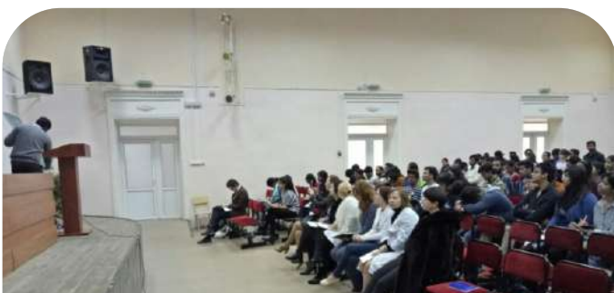
Guest lecturer from India getting their doubts for FMGE answered