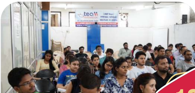
Student getting guidance for FMGE