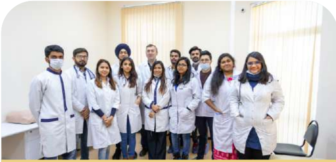
Students from India at PSMU laboratories