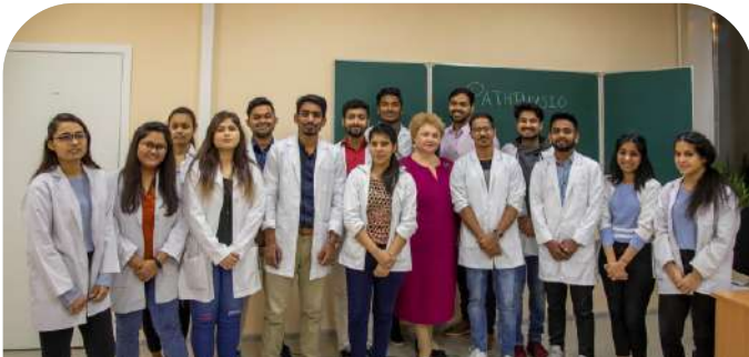
Indian students with their professors at PSMU