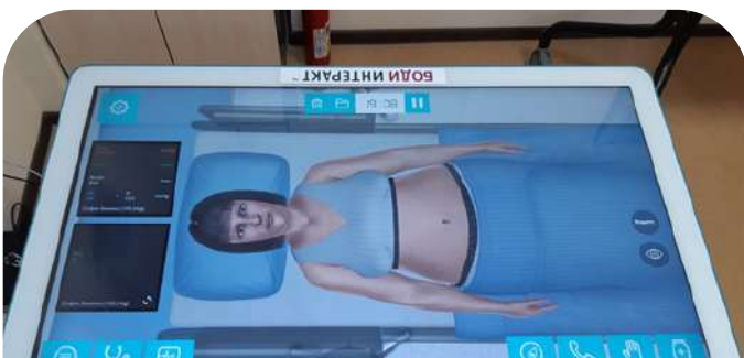
Highly advanced technology used in PSMU labs