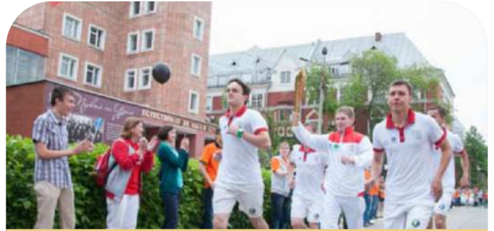
PSMU students participating in the marathon