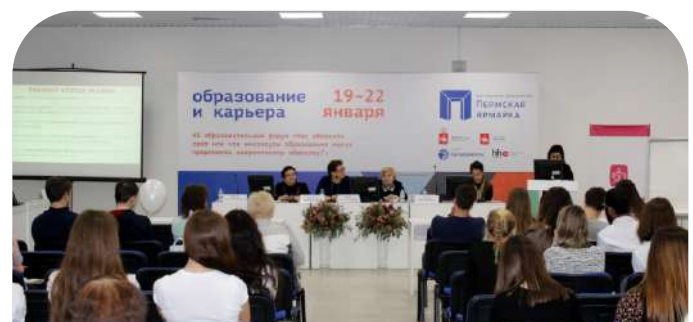
One of the halls of the university where the dissertation by the final year students is being conducted