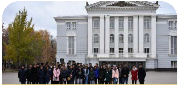
Students at an excursion visit