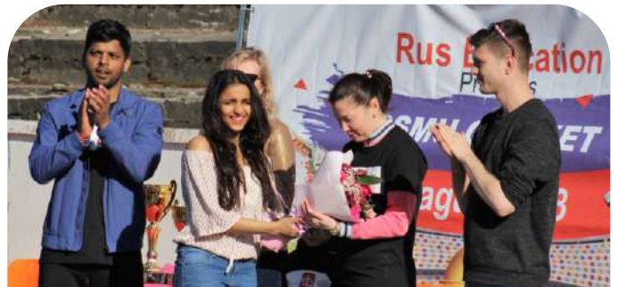
PSMU students and staff at a sports event