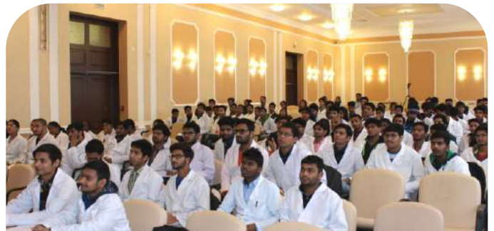
A group of Indian students attending the training at PSMU