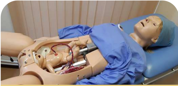
A robotic representation of a woman giving birth