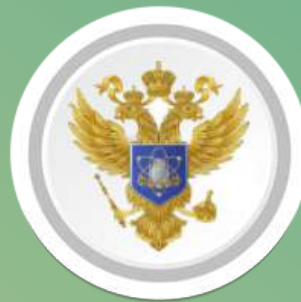
Ministry of Science and Higher Education, Russia

The list of international recognition does not end here. The Perm State Medical University is also recognised by the medical council of several countries like India, Canada, Nepal, Australia, etc, making the hard earned degree at the university valid for most of the nations. Locally the university is accredited with the Ministry of Health, Russia.