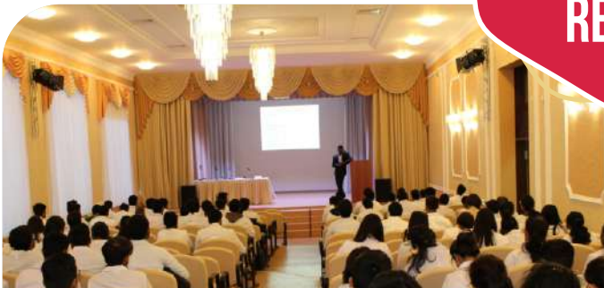
Guest lecturer from India conducting FMGE classes at PSMU

We organize FMGE Coaching at the University with the joint efforts of Rus Education. We invite India's renowned medical faculty members/ Doctors, to summon up their insights regarding FMGE Screening Test. A better and a bright future awaiting for the students at Perm State Medical University.