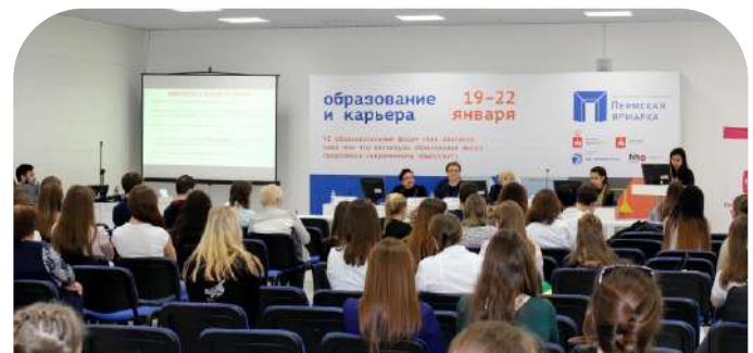
Students, research associates and others attending the conference at the University