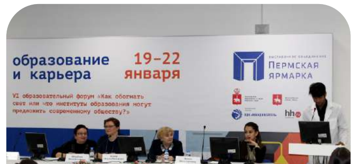
A bench of scholars listens to research findings of the students of Perm State Medical University

Various scientific investigations of Perm physicians have been widely inculcated into practical public health. Every year the total number of utility patents by the research centers of the university exceeds 30. Our scientists take an active part in the contests for the Russian and international grants, thus participating in the work of scientific forums in Russia.