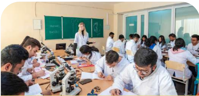
Indian students attending practical classes at PSMU