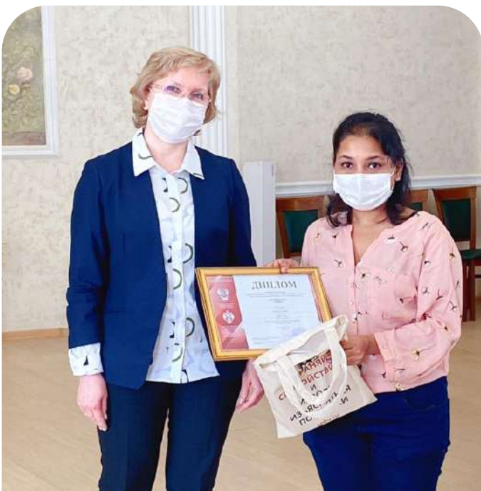
Rector, PSMU giving away certificate of appreciation to an Indian student