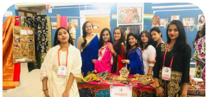
Indian students celebrating local handcraft at PSMU exhibition