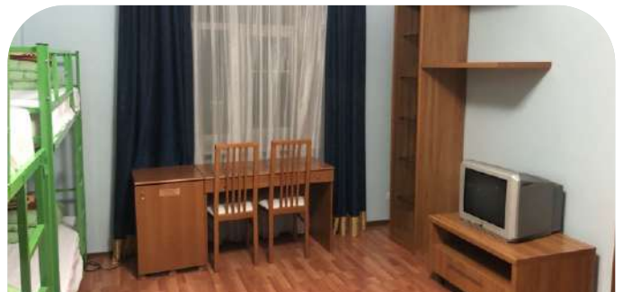
All the hostels at PSMU and well furnished