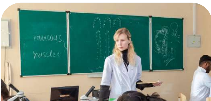
PSMU teacher conducting anatomy classes