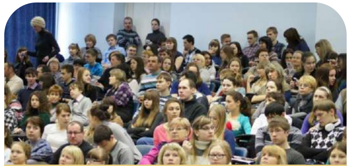
Students of 20+ nations join the international training program at PSMU