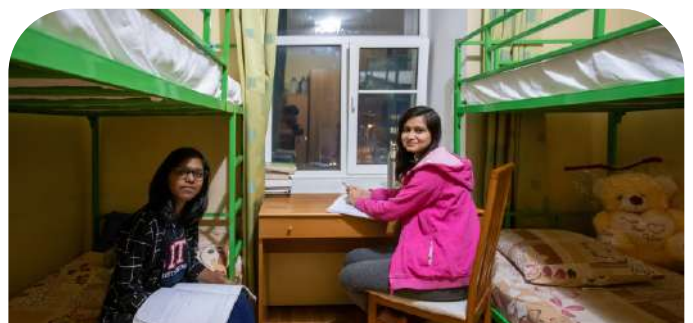
Girls only hostel at PSMU