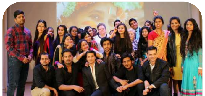
Indian students with their professor at an event