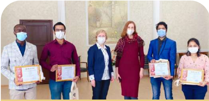
Indian students getting certification of appreciation by the Rector of PSMU