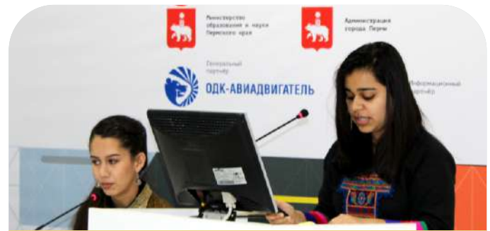
A student presenting her dissertation at the annual conference