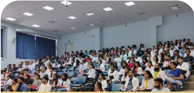
Indian students attending FMGE coaching