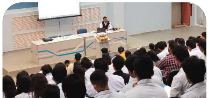
A glimpse of the first year students attending the training